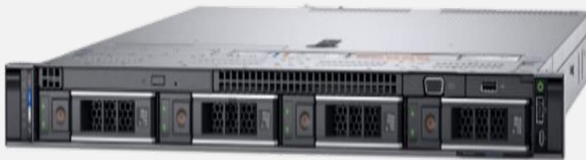
SIA USAM X Series (for illustration purpose only)

Designed to deliver unprecedented level of security in the cyber security space, SIA USAM X Series delivers Silverlake's cyber security products, services, support and maintenance - All in One.